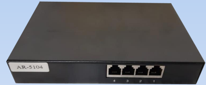
AR 5104: Four Port USB Voice Logger