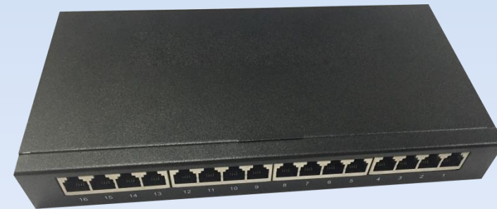
AR 5016: Sixteen Port USB Voice Logger