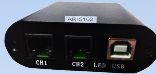
AR 5102: Two Port USB Voice Logger