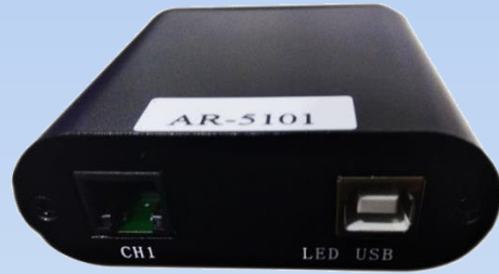
AR 5101: One Port USB Voice Logger