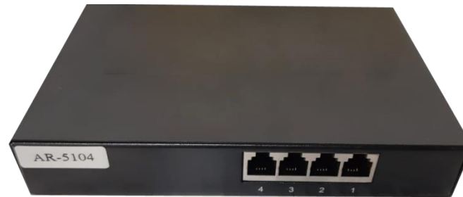
ARIA USB VOICE LOGGER (Telephone Voice Recording System)