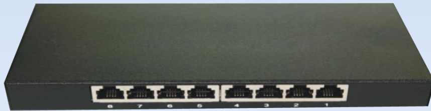
AR 5108: Eight Port USB Voice Logger